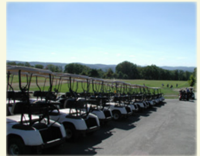
Ely Park Golf Course, 67 Ridge Street