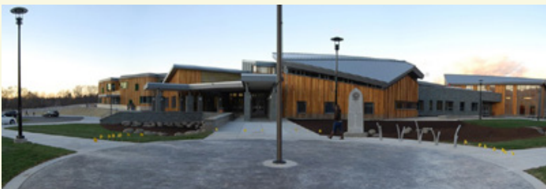
New Mac Arthur Elementary School, 1123 Vestal Avenue