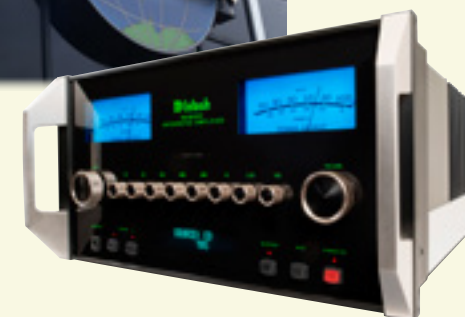
Sought by audiophiles all over the world, premium stereo products are proudly manufactured by McIntosh Laboratories, Inc. at 2 Chambers Street, Binghamton, NY